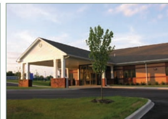
...to project completion!

The end result is a superior, cost effective, quality-controlled product which can help you meet and exceed your project schedule. With modular construction the building is constructed while the site is being prepared creating an accelerated construction process. This allows for faster occupancy of your building... and faster revenue generation for your company.