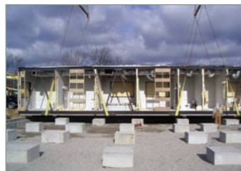
...to on-site installation...