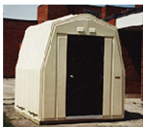
8'x8' General Storage

Call your local sales specialist today for a needs assessment. With nearly 40 years of modular industry experience, ModSpace has the planning and design expertise to successfully implement your project.