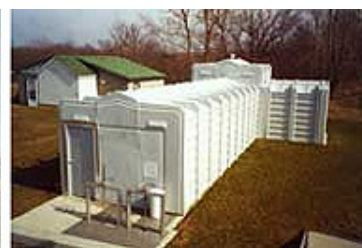
Water Treatment Filter Cover

Need Space? Call ModSpace – your source for modular buildings & storage 800-523-7918 (U.S.) • 800-451-3951 (Canada) • www.modspace.com