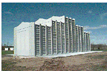
20'x60' Antenna Cover (25' tall)