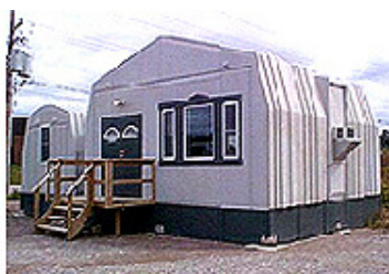
20'x20' Office Unit